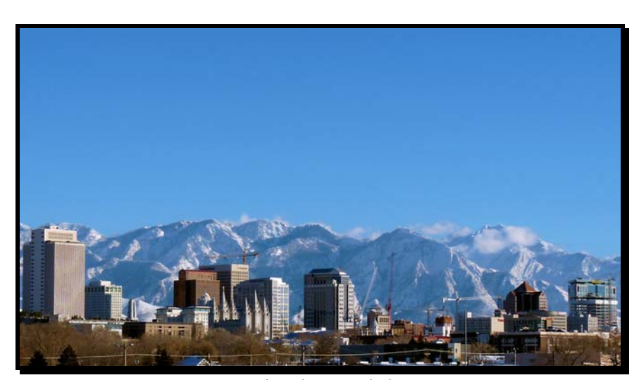
Salt Lake City Skyline

The Society for Ear, Nose and Throat Advances in Children, Inc. , is a non-profit interdisciplinary professional organization founded in 1973. Its members are otolaryngologists, pediatricians, surgeons, pediatric otolaryngologists, speech pathologists, audiologists, nurses, and basic scientists - all of whom are interested in enhancing the care of children with acquired or congenital disorders of the ear, nose, and throat.