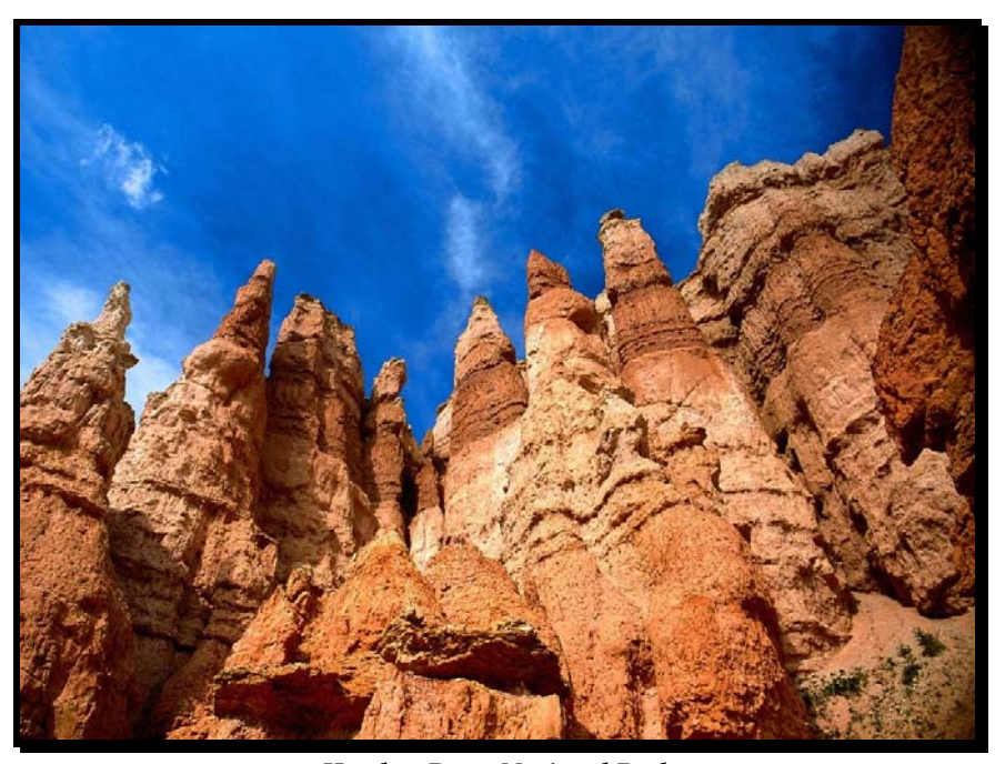
Hoodos, Bryce National Park

As our previous years' participation shows, we are already a diverse group, but we are facing the same challenges as other organizations, including the current economic climate, in continuing this diversity. We need to assess the "value" of membership in our organization as well as participation in our annual meeting by our target groups. To do this, early this fall, an electronic survey will be sent to members and previous conference participants. We hope that you will participate in this survey and let us know what you "value" about our organization as well as some ideas to maintain, if not increase, our diversity. Information from this study will be presented to the board at the 2009 meeting and will be available to 2009 conference participants.